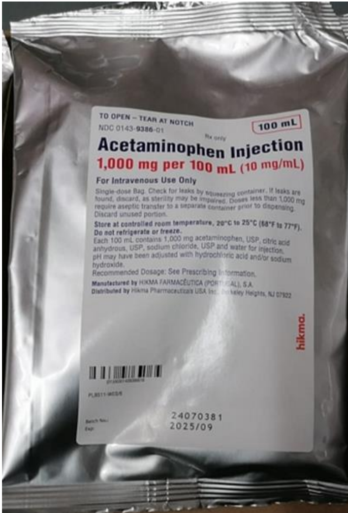
Acetaminophen Injection Shipper Label